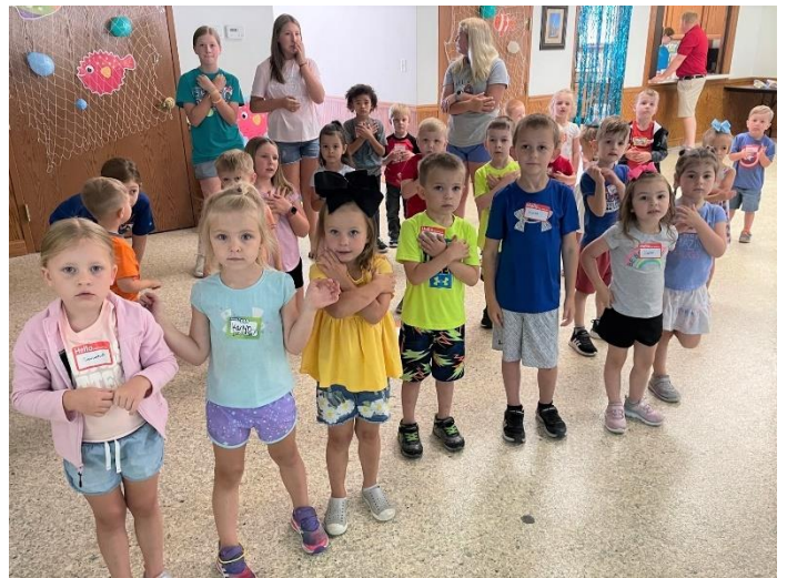
Vacation Bible School students at opening on the first day of VBS (above) while students and family gather in the sanctuary for the closing service (below).

On behalf of the leadership committee we want to thank all that helped, attended, decorated, and made this event such a success. To God be all the glory and honor.