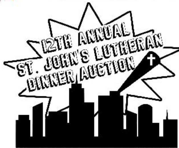
Image below will appear on the front of the shirt.

PUT ON THE WHOLE ARMOR OF GOD. EPHESIANS 6:11